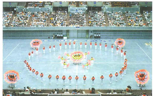
Event Hall of Makuhari Messe

Japanese, Chinese, European and American food will be available at NYC. Breakfast is buffet style. Meals are served from dinner of Aug. 8th to breakfast of 12th. Box style lunch will be served at Makuhari Messe during August 9th–11th Dinner selection can be made from various set menus which include refreshments and a salad bar.